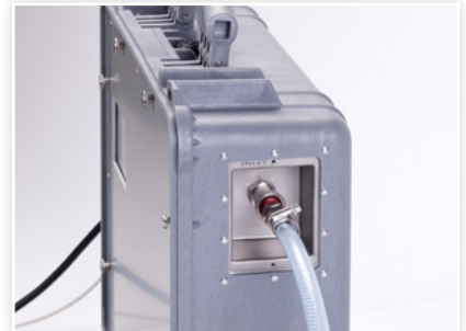
Water line connections