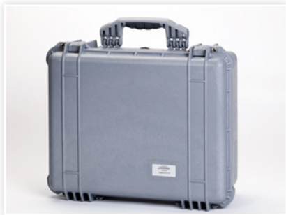
Fully integrated module ready for shipping