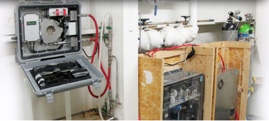
Module for pCO 2 installed and connected